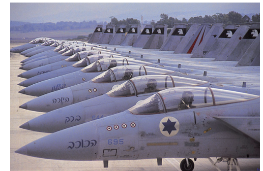
A line of American-made Israeli F 15 fighter jets at an Israeli Air Force base.