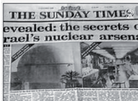
Front page of the British 'Sunday Times' on October 5, 1986: "Revealed: the secrets of Israel's nuclear arsenal."